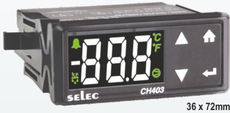
36 x 72mm